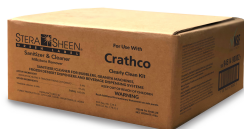
50/1 oz. Packets of Stera-Sheen Green Label Sanitizer & Cleaner

This kit supplements the weekly cleaning requirements outlined in the operators manual