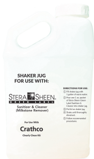
1 Gallon Shaker Jug