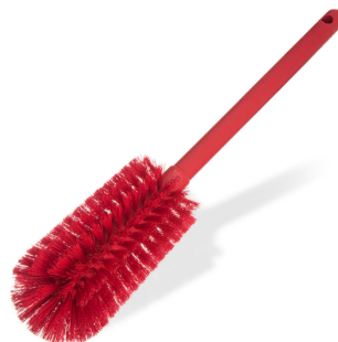
Red Multi-Purpose Soft Bristled Brush