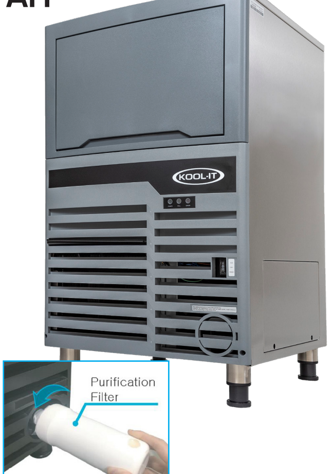
Half Cube Dimensions

5659 Royalmount Ave. Montreal, QC, Canada H4P 2P9 Telephone: 514.737.9701 / Toll Free: 888.275.4538 Fax: 514.342.3854 / Toll Free: 877.453.8832 sales@mvpgroupcorp.com / mvpgroupcorp.com